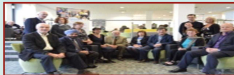
Executive members of International Committee IPDA, U.K.